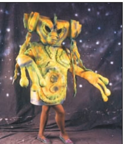
DETAIL: "We are only a speck." Roswell Costume Party, 1997