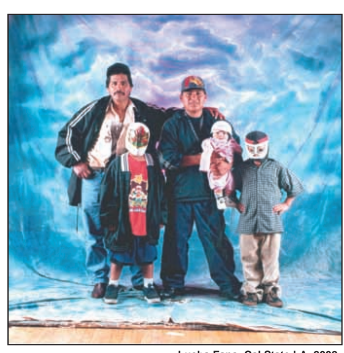
Lucha Fans, Cal State LA, 2002