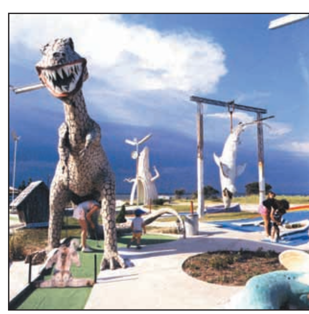
Miniature Golf Course, Panama City, Florida, 1988