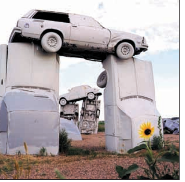
Carhendge with Sunflower, Alliance, Nebraska, 2001