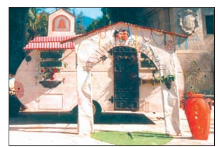
DETAIL: El Palacio del Amor (The Palace of Love) at the SB Courthouse, 1997

For more information on getting a photograph taken at the Palace of Love call CAF at 805-966-5373 x18.